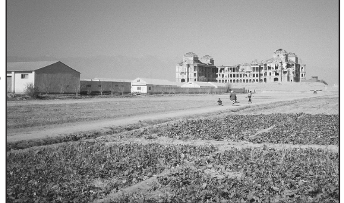
Daral Amaan Research Station - Kabul

We were able to obtain some additional resources for training and together with "core" USAID funding have now conducted some 25 one month short courses for almost 500 Afghans. These courses have been of the "train the trainer" type and most participants have had a BS degree from Afghanistan. Our program has also allowed some short-term Afghan-Pakistan researcher exchanges and the "capstone" activity has been providing MS training at the NWFPAU for 10 young professors (now graduated) and another Ministry of Agriculture extension staff are in MS programs.