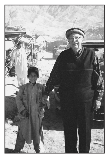
Oval with young child

survey under FAO (UN Food and Agriculture Organization) sponsorship took me to Herat, a city in western Afghanistan. Herat is the most developed city in Afghanistan at the present time, partly since it suffered less damage during the war period, has a long progressive cultural history, and optimistic entrepreneurial people. Wide streets, public parks, decent restaurants, and an ice cream parlor make this a city most of us would like