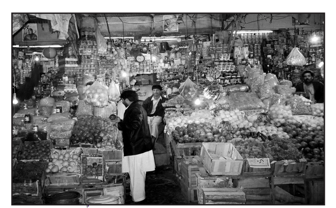
Mazar-e-Sharif - Fruit Vendors

The northern city of Mazar-e-Sharif has also shown great development progress since my first visit in 2004. There are now