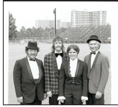
Look of the seventies.

by a more contemporary notchcollared dinner jacket with ruffled dickies, but the color scheme and homburgs were retained.