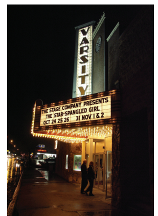
The lights at the Varsity are on again. Opening night, October, 2008, of the just renovated theater.