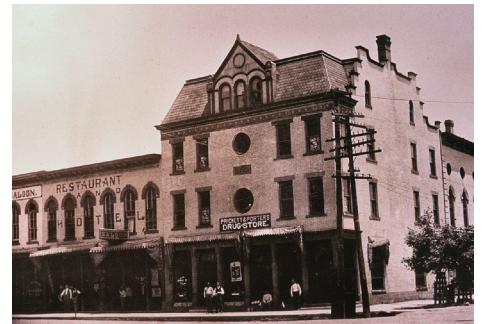
The old bank building, circa 1894, which contained an opera house on the second and third floors.

In its 30 years to date, The Stage Company has produced 178 plays and given over 1100 performances. At first, the Company had no home and rehearsed and performed in many